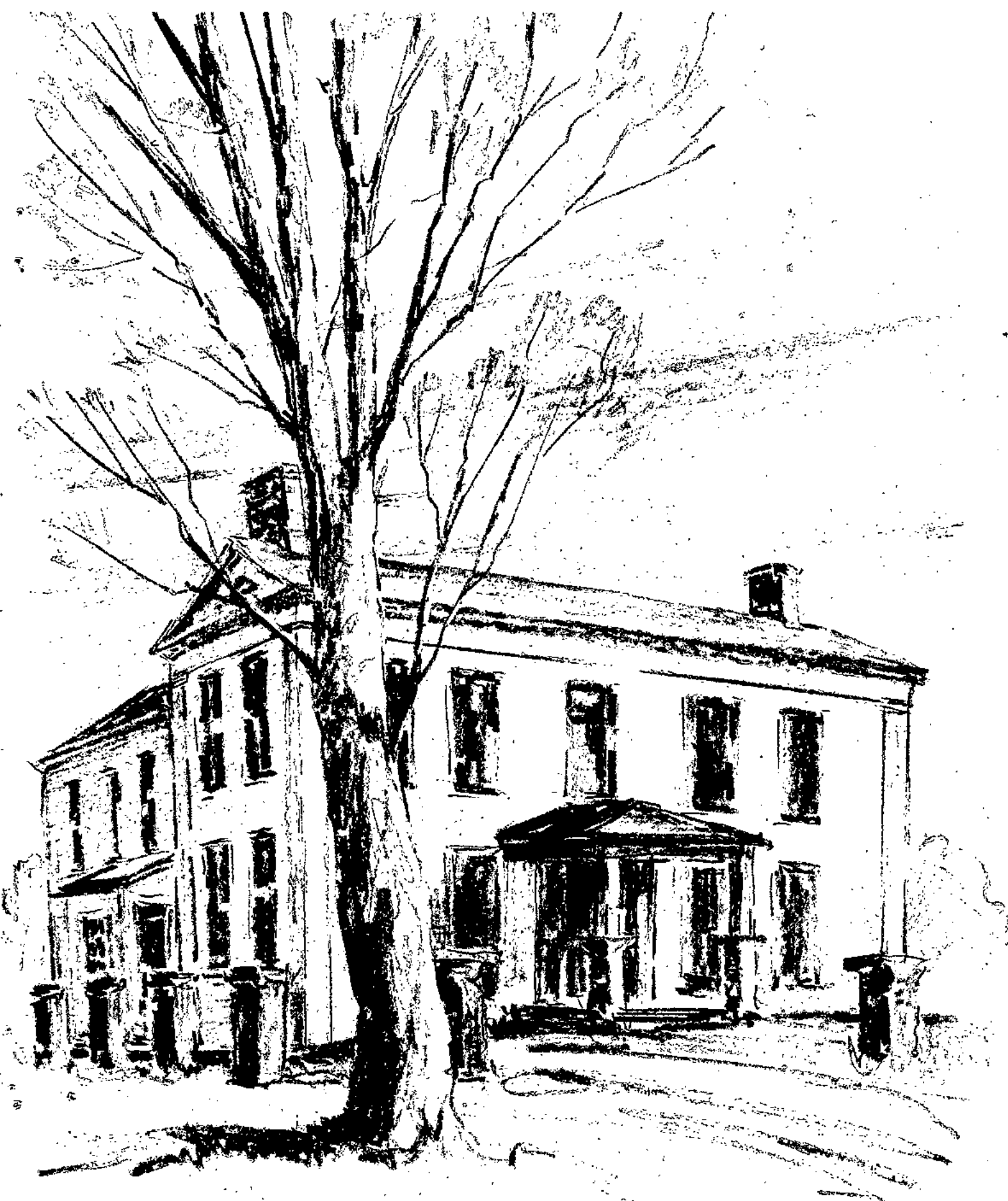
JUDGE HARPUR RESIDENCE - BUILT ABOUT 1810